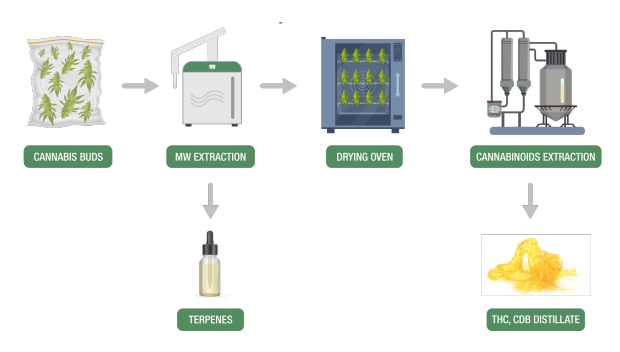
Figure 4. Illustration of the production plant's workflow with microwave processing integrated

Microwave extraction performed with ETHOS platforms, X 2.0 and XL, successfully enabled the capture and isolation of live terpenes on numerous fresh-frozen cannabis strains prior to cannabinoid extraction. Microwave extraction represents a "greener" approach for capturing valuable terpenes without the use of chemical solvents or other purification steps. Materials processed through microwave extraction can then be successfully dried and run through any cannabinoid extraction protocol without any negative residual impact on the cannabinoid molecules themselves (Figure 4).