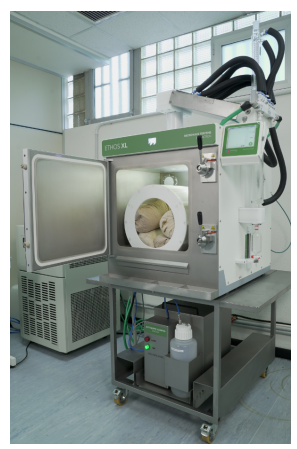
Figure 1. ETHOS XL

ETHOS XL: Up to 10 kg of fresh-frozen cannabis material was loaded into material socks (approximately 2.5 kg of material per material sock). The material socks were sealed and placed inside the ETHOS XL cavity. After the pre-loaded method "full load" was selected, approximately 9L of water filled the cavity and the extraction process began.