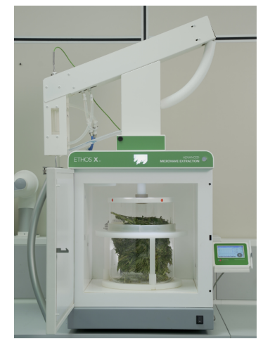
Figure 2. ETHOS X 2.0

ETHOS X 2.0: Up to 2.5kg of fresh-frozen cannabis material was placed in a mixing container. The cannabis buds were mixed with 1.25L of distilled water for 10 minutes (1:0.5, material:water ratio). The mixture was then transferred into the 15L reactor glass vessel and placed inside the X 2.0 cavity. After the desired pre-uploaded method was selected, the extraction process started.